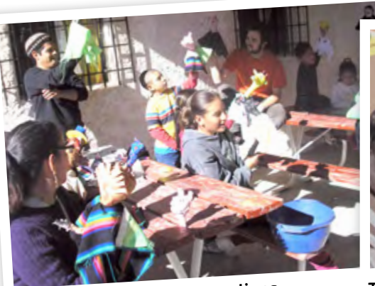
The kids showing the creations.