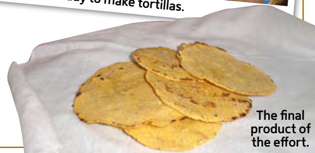
The final product of the effort.