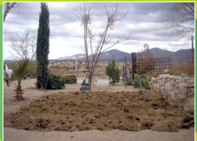
Ready, just have to feed with compost after planting.