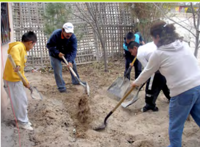
First we prepare the ground.

We hope these families will take care of their land to be able to have a good harvest in summer. We will keep you posted.