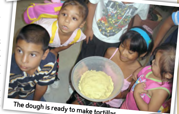
The dough is ready to make tortillas.