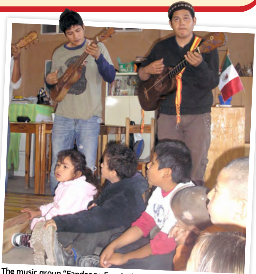
The music group "Fandango Fronterizo" during his performance.

it. It was a beautiful encounter, since they played their jaranas and sung to the children, they told them to dance on a stage, and finally to stage the stories they had created. Their contact is puppetundergrounddc@gmail.com Thanks to the young men and women of Fandango Fronterizo for making their contribution for Ciudad Juarez to recover peace and harmony!