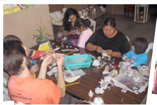
They use various materials to make the puppets.