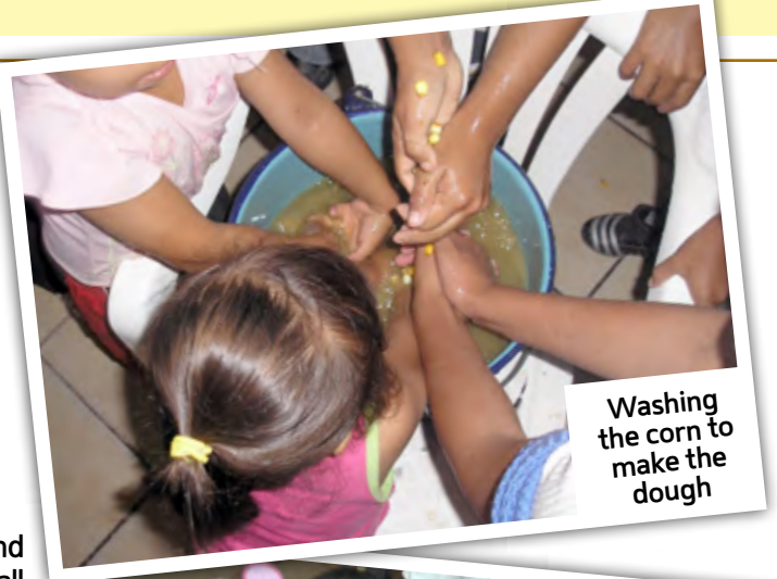
Washing the corn to make the dough

Pictures speak louder than words. May you enjoy them.